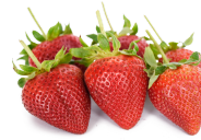
Berries Strawberries Stem 4 x 1 lb (12 - 16 ct) | #923300