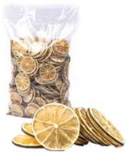
Dried Sliced Lime 300 ct | MWF-9985