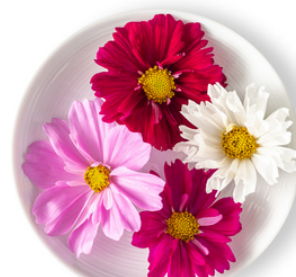
EDIBLE FLOWERS FRESH ORIGINS COSMOS