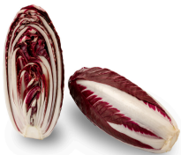
Lettuce Treviso 10 ct | #164000