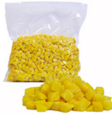
Beet Gold Peeled & Diced 2/5lbs. #142902