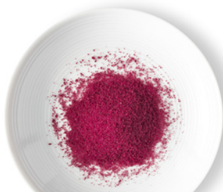
MINI FLOWER CRYSTALS® FRESH ORIGINS HIBISCUS