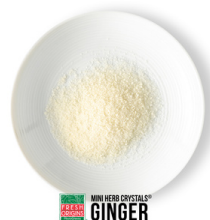
Ginger Crystals 6 oz | 01-12025

Chicago, IL | 773.927.8870 | midwestfoods.com | Kenosha, WI