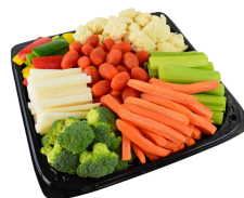
Vegetable Tray 1 Day Notice 1/5lbs. #823508

Full selection of pre-cut items available in the ordering portal and at midwestfoods.com