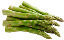
Asparagus Jumbo 11 lb | #154400