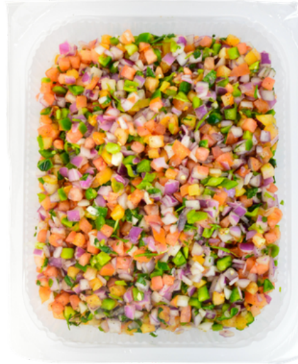
Pico De Gallo 3/8" 2x5 lb #210142 made in-house with fresh produce