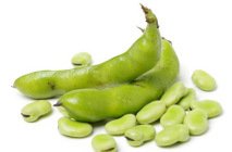
Fava Beans 25 lbs | #155200P