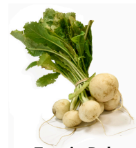
Turnip Baby 24 ct | #179700P