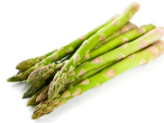
Asparagus Large 11 lb | #154500