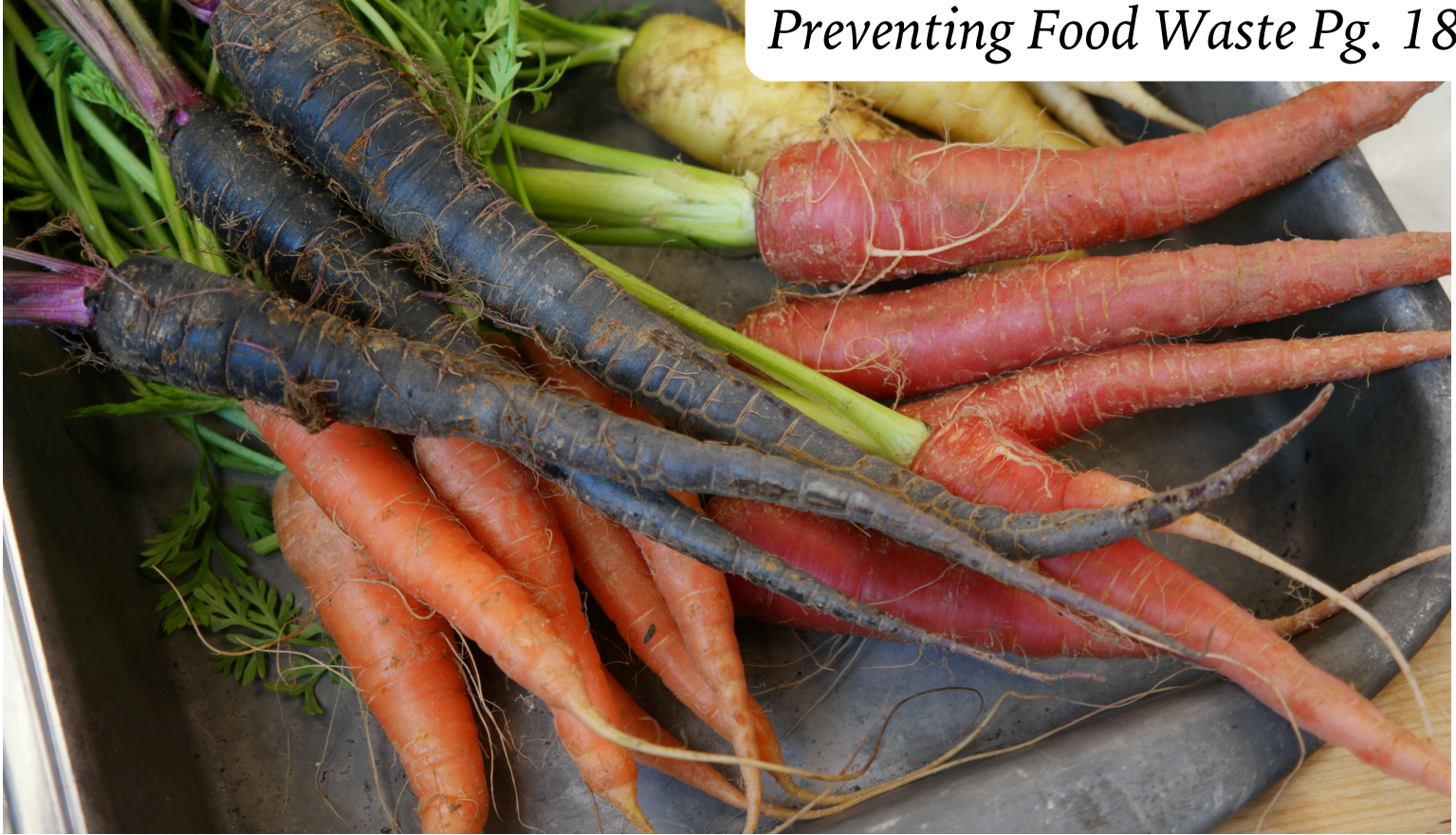
Preventing Food Waste Pg. 18