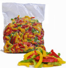
EC Pepper Julienne Tri-Color 3/8" 2 x 5 lb #210144