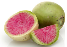
Watermelon Radish 5 lbs | #01-4607