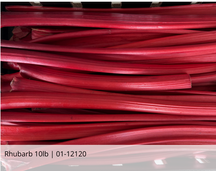
Rhubarb 10lb | 01-12120