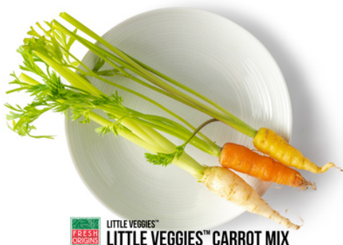
LITTLE VEGGIES™ FRESH ORIGINS LITTLE VEGGIES™ CARROT MIX