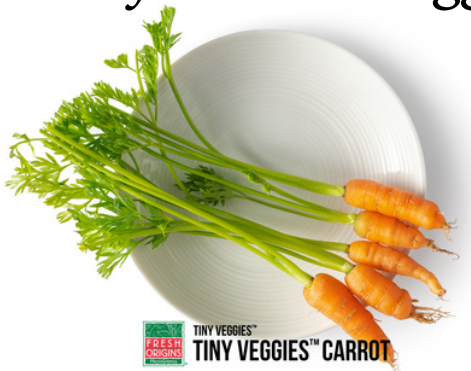
TINY VEGGIES™ FRESH ORIGINS TINY VEGGIES™ CARROT