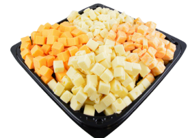
Cheese Tray 1 Day Notice Cheddar/Swiss/Curds 6lbs. #01-10872