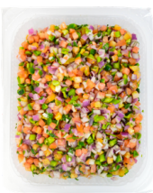
Pico De Gallo 3/8" 2 x 5 lb #210142