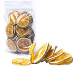
Dried Yellow Lemon 170 ct | MWF-9986 72 HR Notice