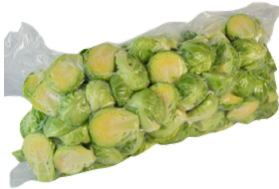
Brussels Sprouts Halves 4 x5 lbs. # EC-1007