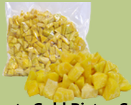
Beets Gold Bistro Cut 2-5 lbs | #01-1847