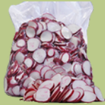
Radish Sliced 1/8" LOCAL 2-5 lbs | #142601