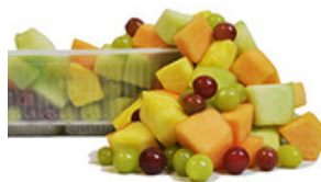
Fruit Mixed Chunk 3/4" 2/5lbs. #6546313