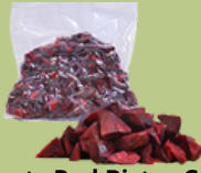
Beets Red Bistro Cut 2-5 lbs | #01-1845