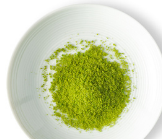
MINI HERB CRYSTALS® FRESH ORIGINS BASIL