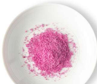
MINI FLOWER CRYSTALS® FRESH ORIGINS ROSE