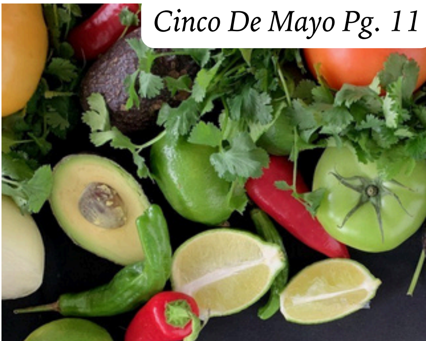
Cinco De Mayo Pg. 11