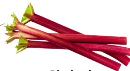
Rhubarb 10 lbs | #01-12120