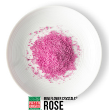
Rose Crystals 6 oz | #01-12027