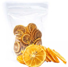
Dried Sliced Orange 126 ct | MWF-9988 72 HR Notice