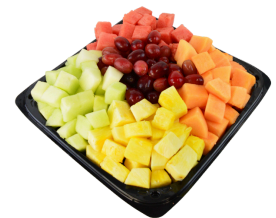
Fruit Tray Assorted 1 Day Notice 5lbs. #4354355