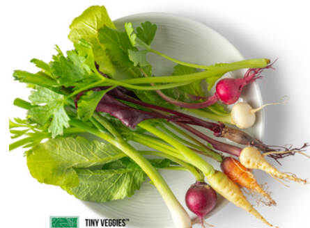
TINY VEGGIES™ FRESH ORIGINS TINY VEGGIES™ CRUDITE MIX™