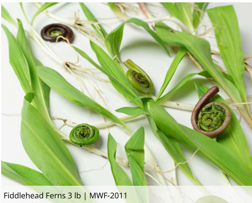
Fiddlehead Ferns 3 lb | MWF-2011 Ramps | 1005