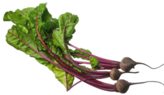
Red Baby Beets w/ Tops 24 ct | #156200P