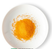
Habanero Crystals 6 oz | 01-12028