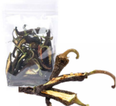
Dried Slice Jalapeno w/ Hook 120 ct | MWF-9996