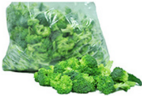
Broccoli Florets 4 x 3 lb #136201

Save time & reduce labor costs with 100% yield pre-cut produce that arrives ready-to-use without ever breaking the cold chain.