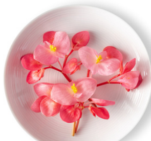
EDIBLE FLOWERS FRESH ORIGINS BEGONIA FLOWER PINK