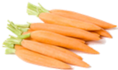
Carrot Baby Orange w/Tops 24 ct | #158500P