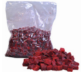
Beet Red Peeled & Diced 1/2" 2/5lbs. #582762