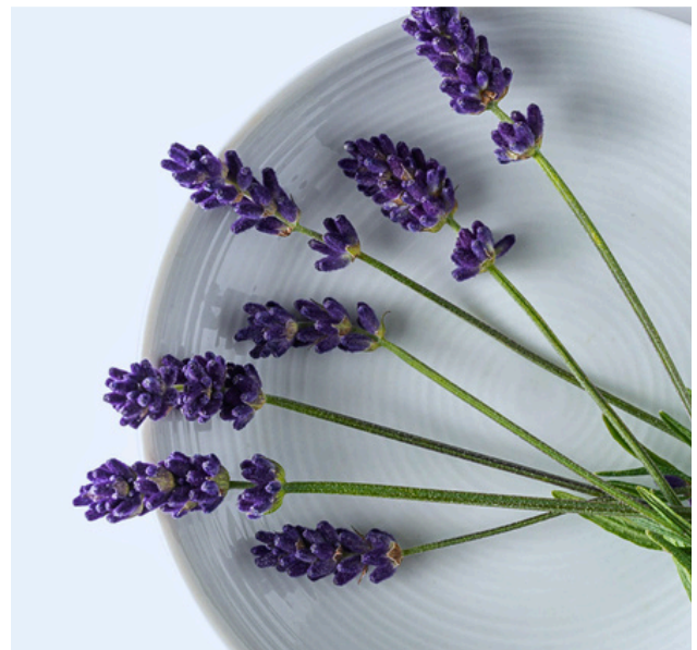
Plating Inspiration Pg. 13