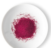
Hibiscus Crystals 6 oz | 01-12026