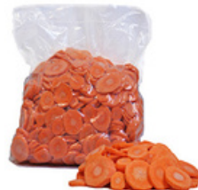
Carrots Coin 1/4" 2 x 5 lb # 136800