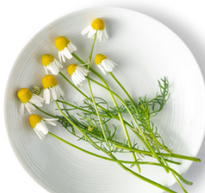
EDIBLE FLOWERS FRESH ORIGINS CHAMOMILE FLOWER