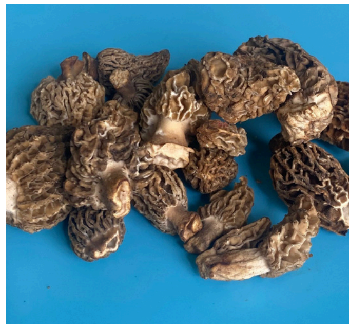
Morel Mushrooms 5 lb | 16501 Special Order