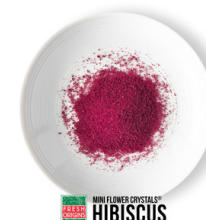
Hibiscus Crystals 6 oz | 01-12026