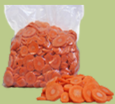
Carrot Coin 1/4" 2-5 lbs | #136800