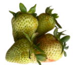
Berries Green Organic COMING SOON 12 x 1 pt | #MWF-9758