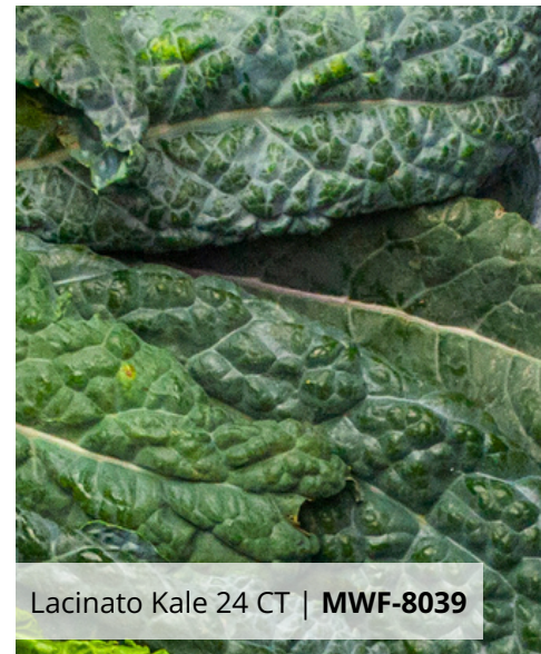
Lacinato Kale 24 CT | MWF-8039

"Producing locally grown food is central to the mission of my farm. I look forward to the opportunity to continue to collaborate and work with individuals, businesses, and organizations who value the production and distribution of locally grown food."