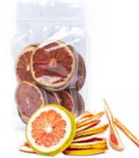
Dried Pink Grapefruit 84 ct | MWF-9987 72 HR Notice