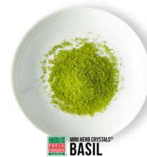
Basil Crystals 6 oz | #01-12022