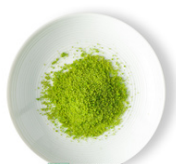
Mint Crystals 6 oz | 01-12024