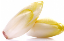
Endive White Belgian 10 lbs | #180450P