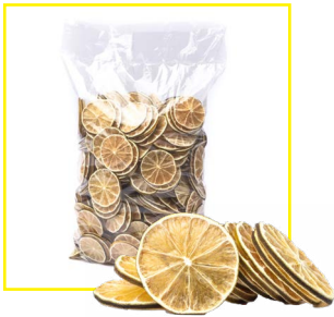
Dried Sliced Lime 300ct | MWF-9985