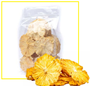
Dried Sliced Pineapple 120ct | MWF-9990