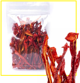
Dried Sliced Red Pepper Sticks 300ct | MWF-9997