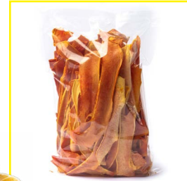
Dried Sliced Papaya 110ct | MWF-9995