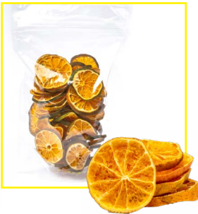
Dried Sliced Mandarin 126ct | MWF-9989