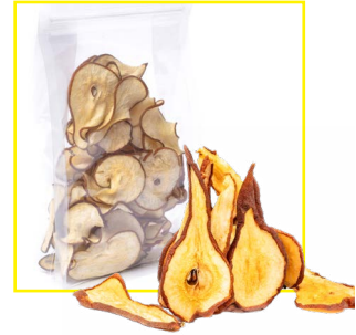
Dried Sliced Pear 180ct | MWF-9991