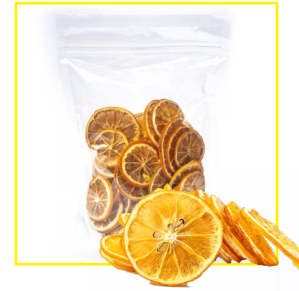
Dried Sliced Yellow Lemon 170ct | MWF-9986