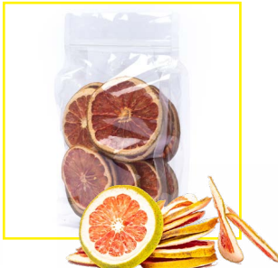
Dried Sliced Pink Grapefruit 84ct | MWF-9987