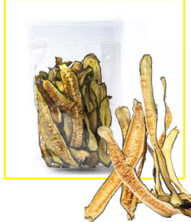
Dried Shaved Cucumber 75ct | MWF-9998