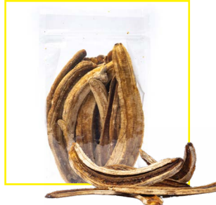
Dried Sliced Banana 75ct | MWF-9994