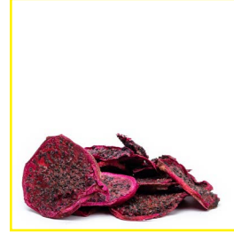
Dried Sliced Dragon Fruit Red 1lb | MWF-9993