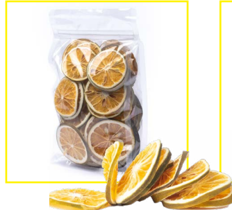
Dried Sliced Orange 126ct | MWF-9988