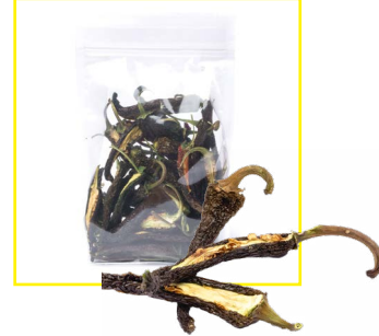
Dried Sliced Jalapeno w/Hook 120ct | MWF-9996