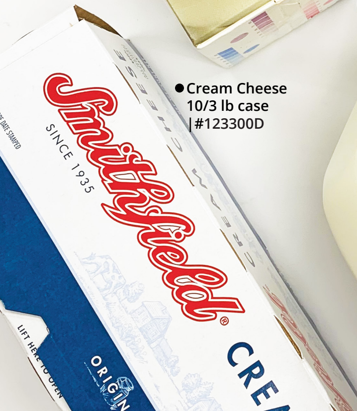
● Cream Cheese 10/3 lb case #123300D