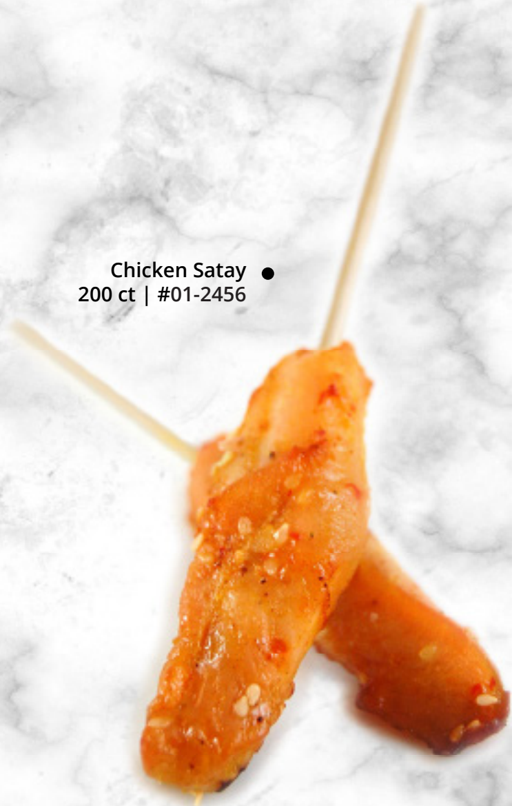
Chicken Satay ● 200 ct | #01-2456