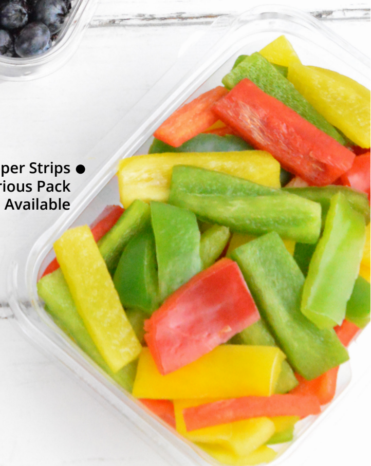
● Rainbow Pepper Strips ● 16 oz | Various Pack Sizes Available