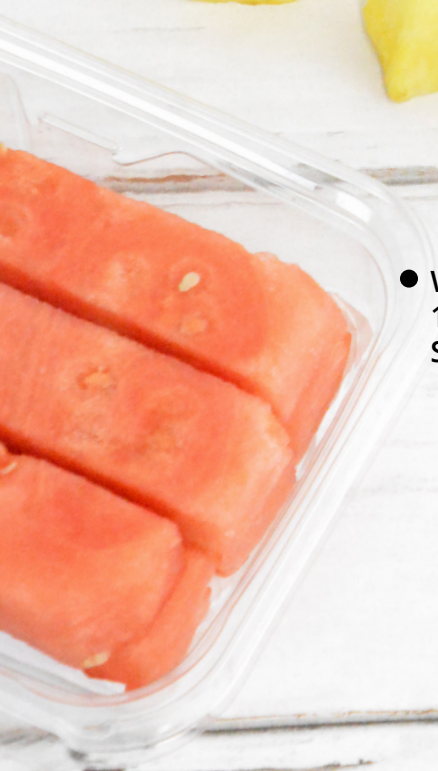
● Watermelon Spears 14 oz | Various Pack Sizes Available