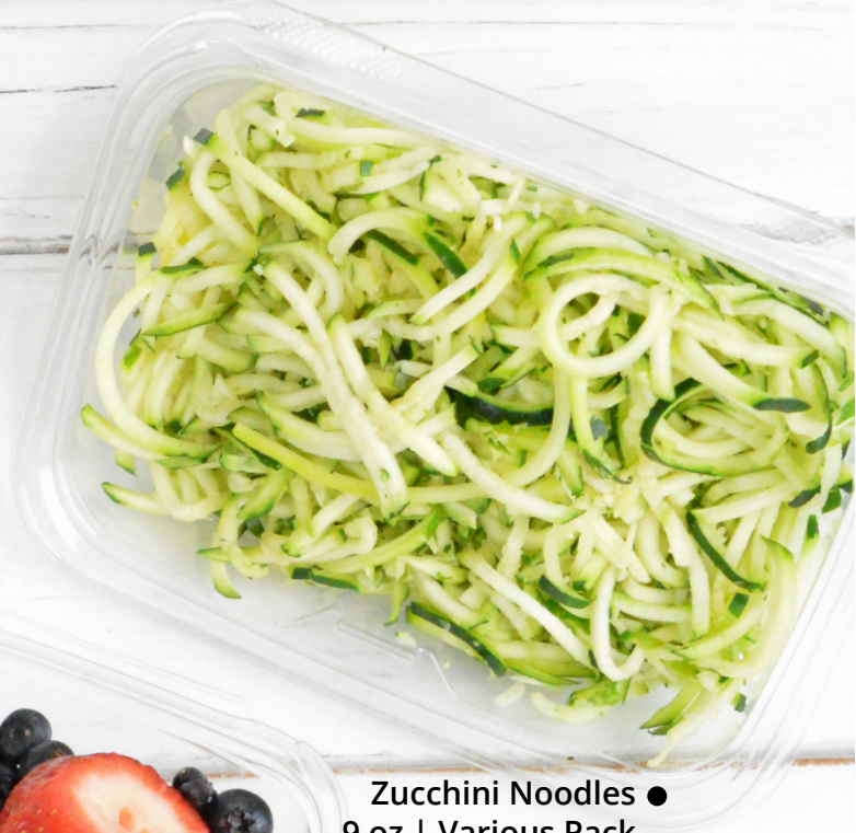
● Zucchini Noodles ● 9 oz | Various Pack Sizes Available