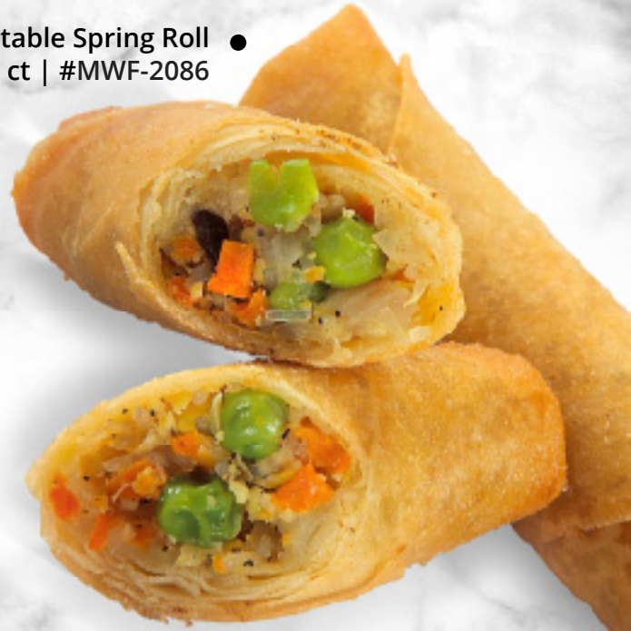
Vegetable Spring Roll ● 200 ct | #MWF-2086