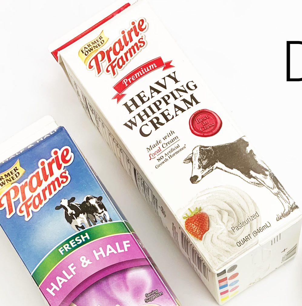
● Half & Half Quart | #01-3630