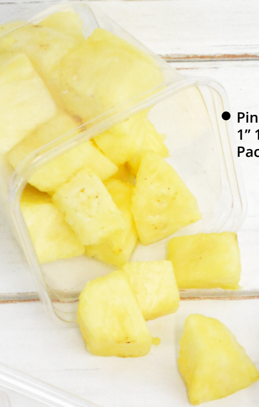
● Pineapple Chunk 1" 14 oz | Various Pack Sizes Available