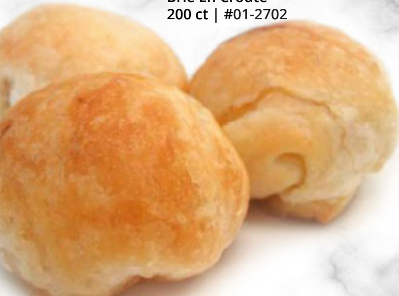
● Brie En Croute 200 ct | #01-2702