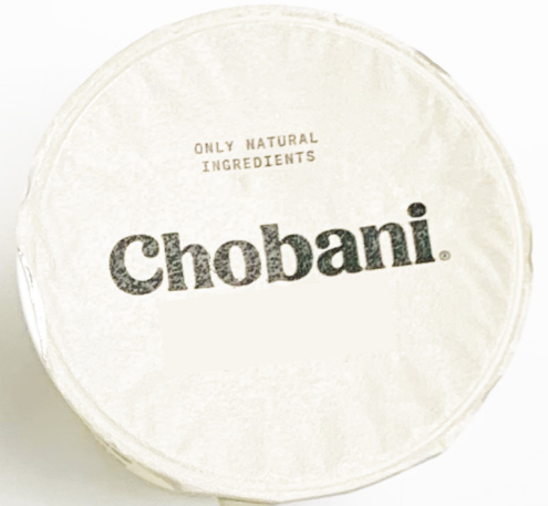
● Chobani Vanilla Yogurt 12/ 5.3 oz | #553297