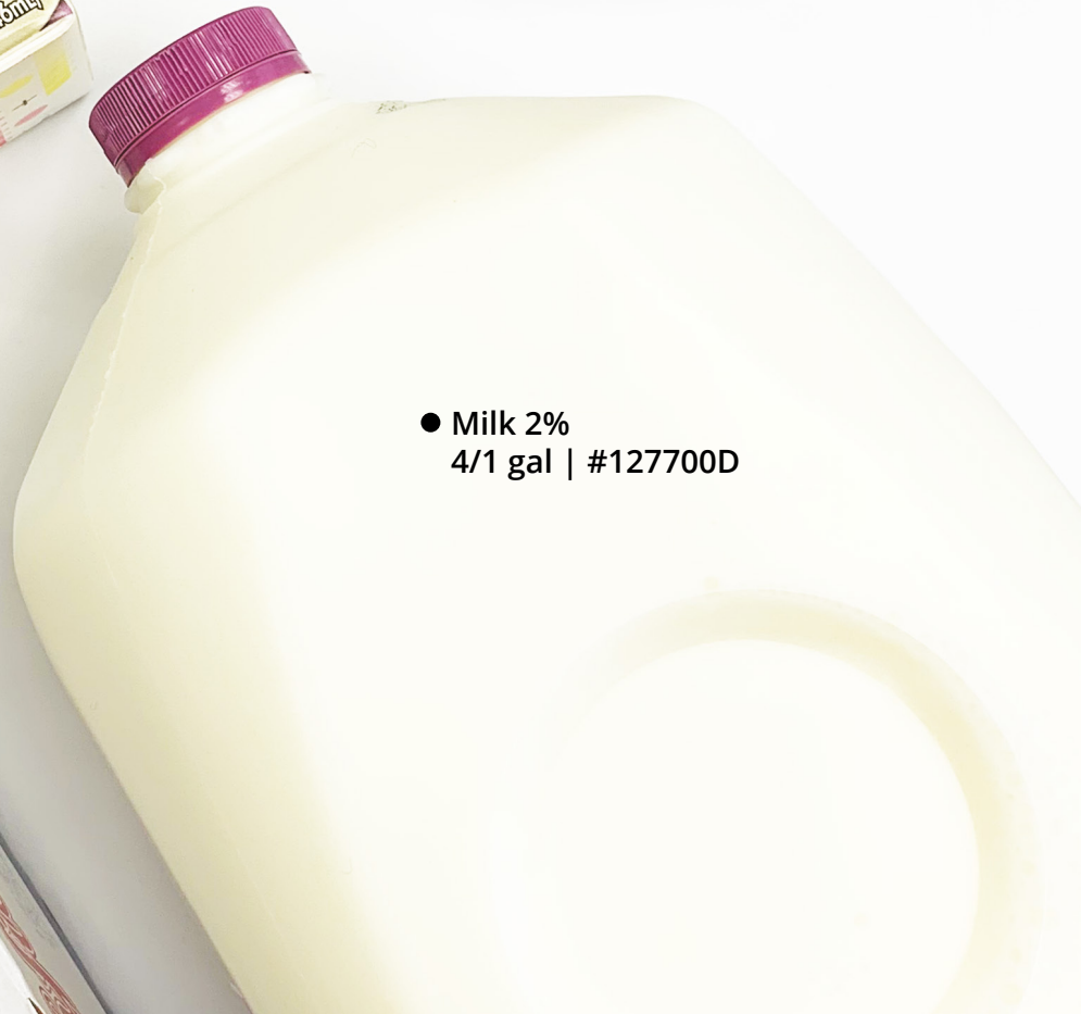
● Milk 2% 4/1 gal | #127700D