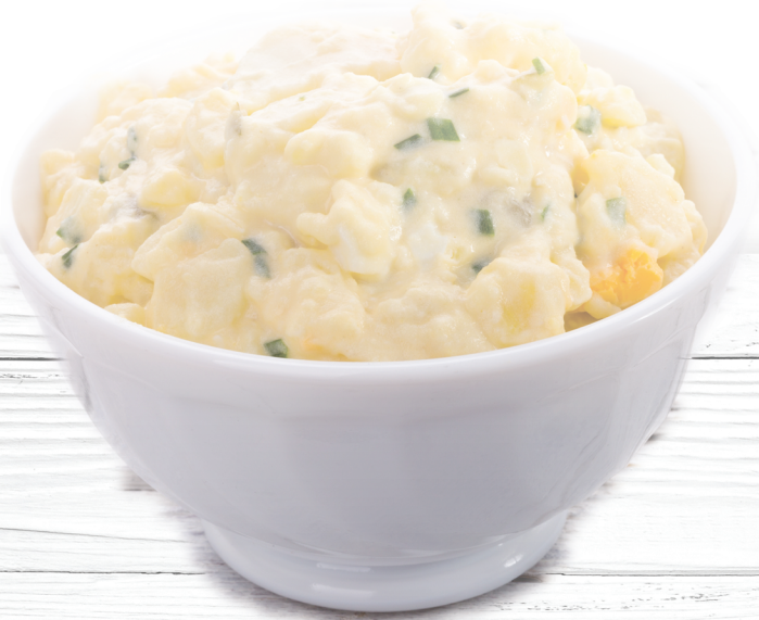
● Potato Salad w/Mayo 10 lb | #146900