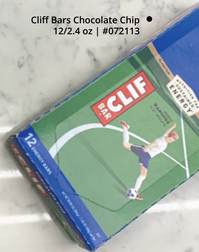
● Cliff Bars Chocolate Chip 12/2.4 oz | #072113