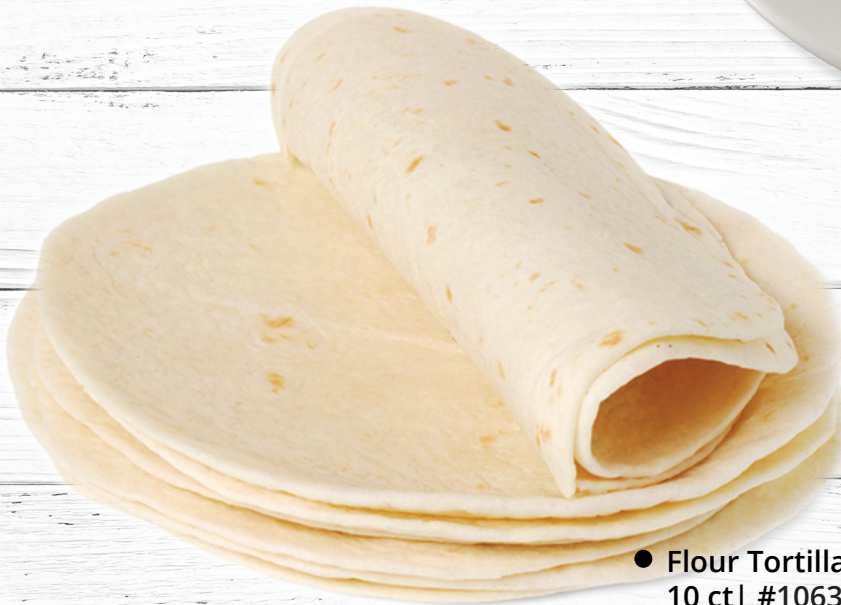
● Flour Tortillas 10 ct | #106300