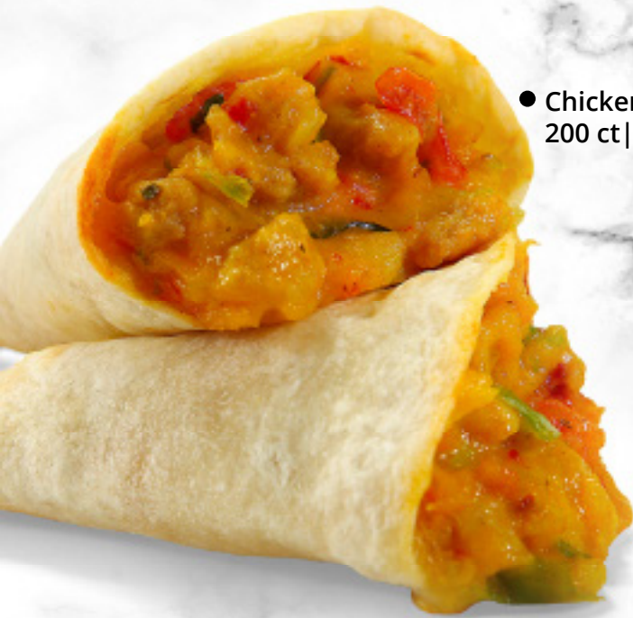
● Chicken Quesadilla 200 ct | #3020100