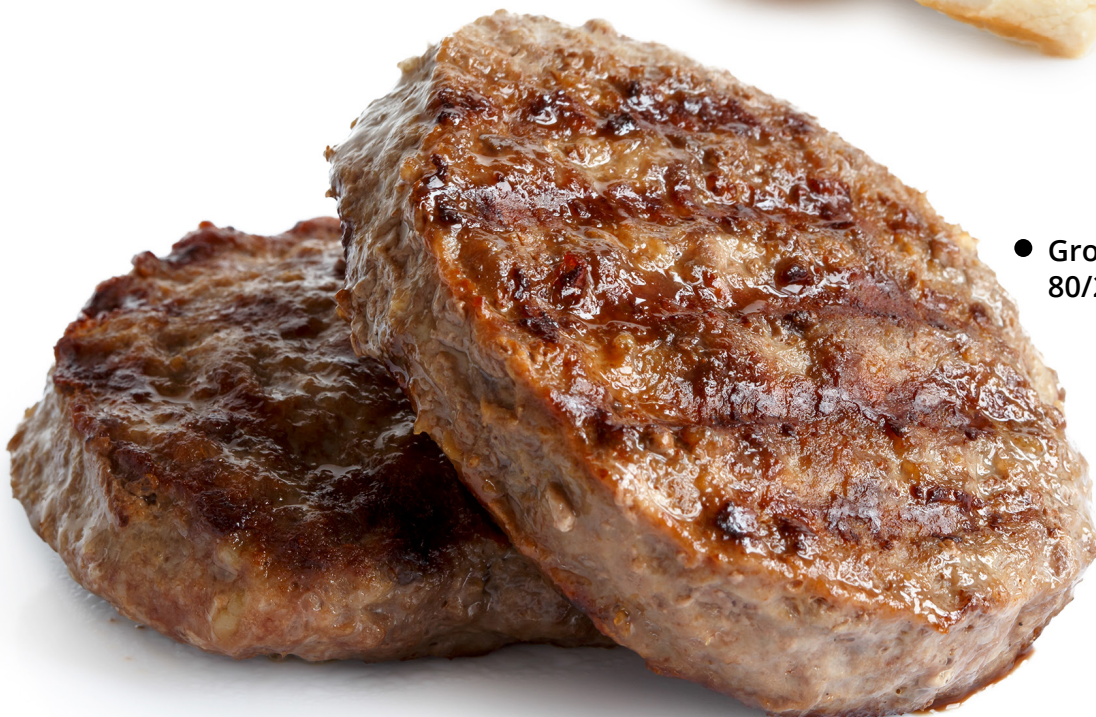
● Ground Beef 80/20 1- 10 lb | #060001