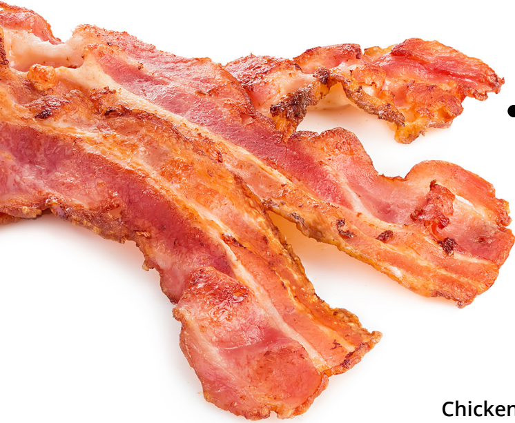
● Applewood Bacon 15 lb | #210029