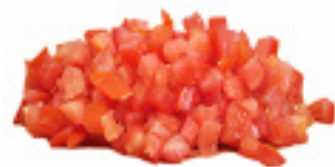
Tomato Diced 3/8"

2 - 5 lbs. # 78913321 5 lbs. # 01-2402 10+