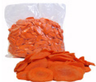
Carrot Bias Cut 1/4" 2 - 5 lbs. # 210163