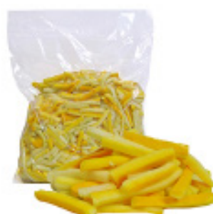
Squash Yellow Julienne

1" 2-5 lbs. # 139302 10+ 3/4" 2-5 lbs. # 172001 10+ 1/2" 2-5 lbs. # 172000 3/8" 2-5 lbs. #01-2236 10+ 1/4" 2-5 lbs. # 7488046 10+