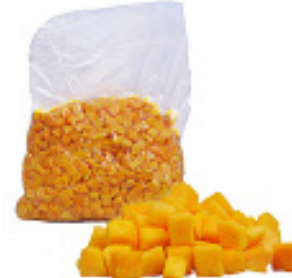
Squash Butternut Peeled & Diced

1" 2-5 lbs. #01-11909 3/4" 2-5 lbs. #15020 1/2" 2-5 lbs. #181060 1/4" 2-5 lbs. #180203 10+