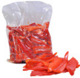
Pepper Red Wedge