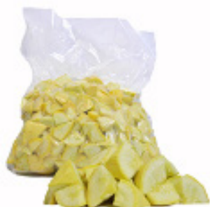
Squash Yellow Bistro Cut