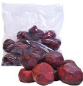
Beets Red, Peeled