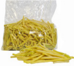
Beans, Yellow Wax Trimmed