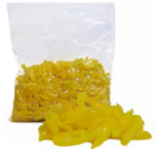
Pepper Julienne Yellow 3/8"

3/4" 2-5 lbs. # 01-4162 10+ 1/2" 2-5 lbs. # 141400 10+ 3/8" 2-5 lbs. # 167900 10+