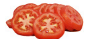
Tomato Plum Sliced