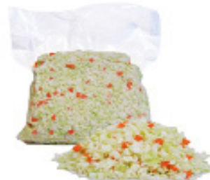
Cabbage Diced 1/4" With Color (90% 3/4" Cabbage. 10% 1/4" Carrots) 4 - 5 lbs. # 136100 10+