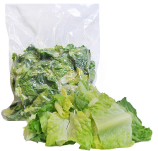
Lettuce Romaine Chopped 2" x 2" 3 - 4 lbs. # 139001 10+