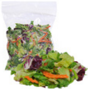
Lettuce Italian Blend Romaine, Radhiccio 90/10