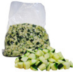
Squash Zucchini Diced

3/8" 2-5 lbs. # 142901 10+ 1/4" 2-5 lbs. # 142900