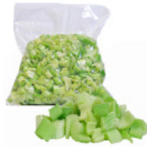
Celery Sliced 1/4"