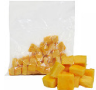
Pumpkin Peeled & Diced 1" Seasonal