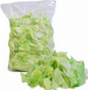
Lettuce Iceberg Chop 1" x 1" 4 - 5 lbs. # 139201 10+