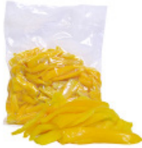
Pepper Wedge Yellow 1/2" x 3.5"