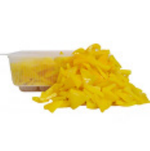
Pepper Bistro Cut