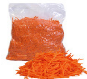
Carrot Matchstick 1/8" x 3" 2 - 5 lbs. # 01-1231