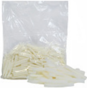
Jicama Sticks 3/8" x 3" 2 - 5 lbs. # 161101 10+