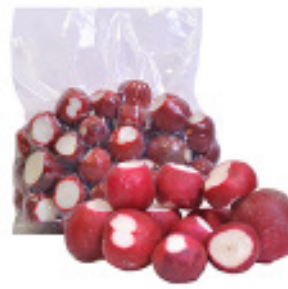
Radish Whole Cleaned