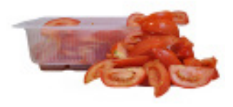
Tomato Roma Wedge 8 Cut

1" 2-5 lbs. # 01-1124 10+ 1/2" 2-5 lbs. # 160901 10+ 1/4" 2-5 lbs. # 101810