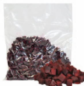
Beets, Red Peeled & Diced

1/2" 2 - 5 lbs. # 582762 1" 2 - 5 lbs. # 125855 10+