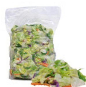
Lettuce American Romaine Blend, Head Lettuce, Red Cabbage, Carrots. 4 - 5 lbs. # 138702 10+