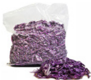
Cabbage Red Shred 1 - 5 lbs. #01-3974 1/8" 2 - 5 lbs. #136200