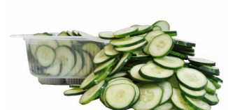
Cucumber Sliced 1/8"