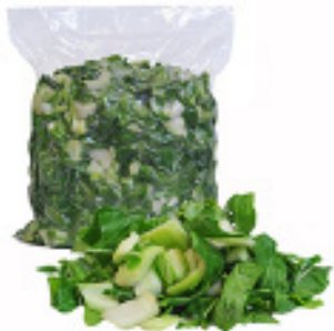
Bok Choy, 1" Chop