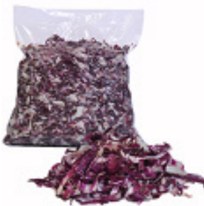
Lettuce Radicchio Shredded 1/2" 2 - 5 lbs. # 01-2465 10+