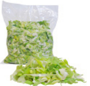
Leek Julienne 2 - 5 lbs. # 163900 10+