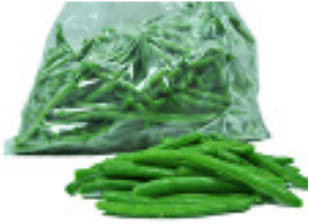
Beans, Green Trim and Clean