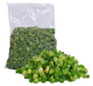
Peppers Jalapeno Diced 1/4"