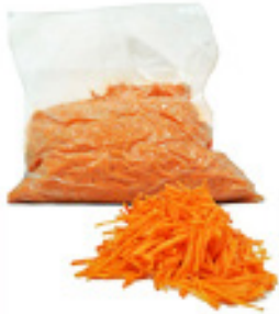
Carrot Shoestring 1/8" x 6"