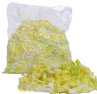
Cabbage Napa Shred 1/8" 4 - 5 lbs. #1361963 10+ 3/8" 4 - 5 lbs. #014901