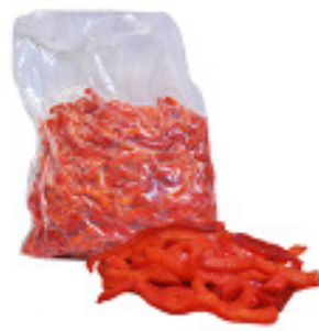
Pepper Red Julienne

# 427428 3/4" 2 - 5 lbs. # 141005 10+ 1/2" 2 - 5 lbs. # 01-1128 3/8" 2 - 5 lbs. # 141200 10+ 1/4" 2 - 5 lbs. # 852194