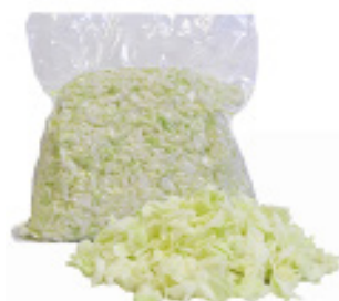
Cabbage Diced NO Color 1/2" 4 - 5 lbs. #45413222 10+ 1/4" 4 - 5 lbs. #148318 10+