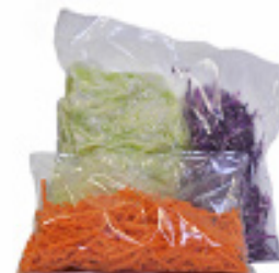
Cabbage Shred With Color 3/8" 4 - 5 lbs. #136002 10+ 1/8" 4 - 5 lbs. #136300