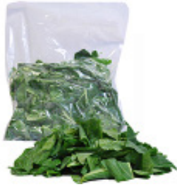
Greens Collard Chop 2" x 2" 2 - 5 lbs. #8563222