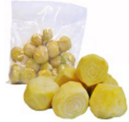
Beets, Gold Peeled