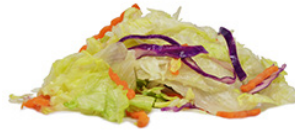
Garden Blend Salad Lettuce, Carrots, Red Cabbage