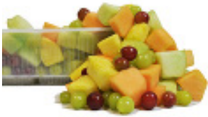
Fruit Mixed, Chunk