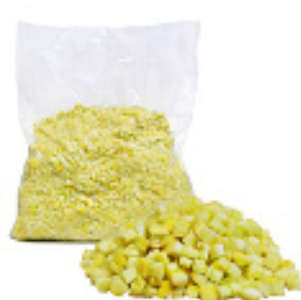
Squash Yellow Diced

1" 2-5 lbs. # 139302 10+ 3/4" 2-5 lbs. # 172001 10+ 1/2" 2-5 lbs. # 172000 3/8" 2-5 lbs. #01-2236 10+ 1/4" 2-5 lbs. # 7488046 10+