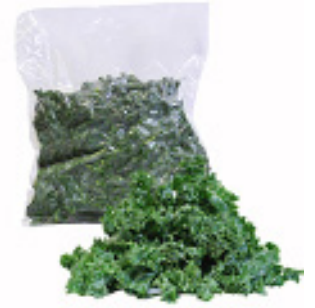
Kale Chopped Organic 1" 2 - 5 lbs. # 01-12045 10+