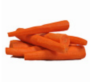
Carrot Whole Peeled