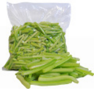
Celery Julienne 1/4" x 2"