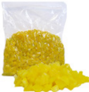
Pepper Diced Yellow

3/4" 2-5 lbs. # 01-4162 10+ 1/2" 2-5 lbs. # 141400 10+ 3/8" 2-5 lbs. # 167900 10+