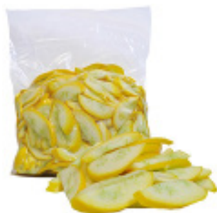
Squash Yellow Halfmoon Bias Bistro Cut