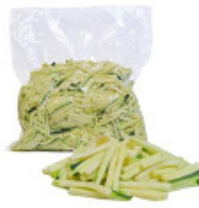
Squash Zucchini Julienne

3/4" 2-5 lbs. #748548 10+ 1/2" 2-5 lbs. # 098400 3/8" 2-5 lbs. # 01-2237 10+ 1/4" 2-5 lbs. #7488044 10+