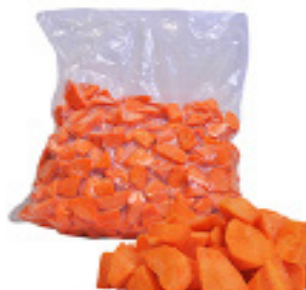
Carrot Bistro Cut 2 - 5 lbs. #136701