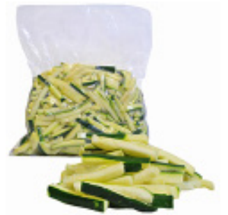
Squash Zucchini Sticks 3/8" x 3"