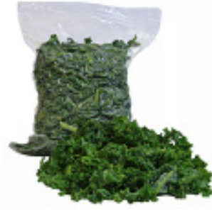
Kale Chopped 1" 2 - 5 lbs. # 8596333