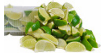
Lime Wedge 8 Cut