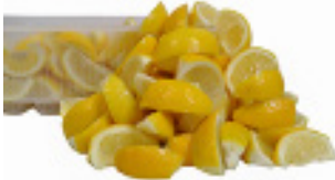
Lemon Wedges, 140 ct.