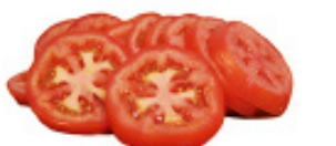
Tomato Sliced (5/6)