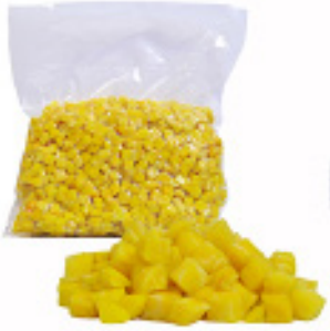
Beets, Gold. Peeled & Diced 1/2"