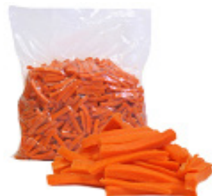
Carrot Julienne 1/4"x2" 2 - 5 lbs. # 137200 10+