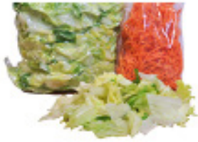
Lettuce Chef Salad Shredded Carrots, Red Cabbage (Inv Bags, 3 Way)