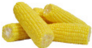
Corn Shucked and Cleaned