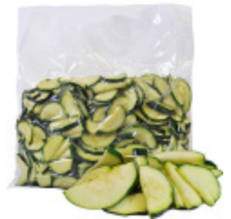
Squash Halfmoon Coin 1/4"