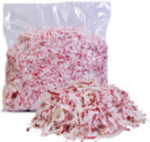
Radish Shredded 1/8"