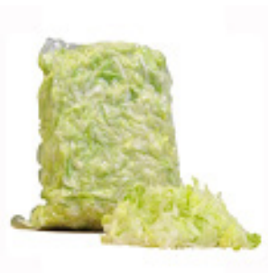
Lettuce Romaine Shred 1/2" 3 - 4 lbs. # 181230 10+