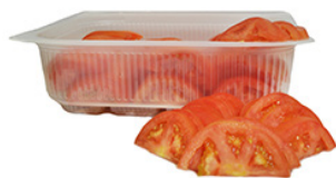
Tomato 1/2 moon