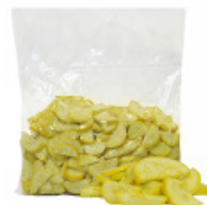
Squash Yellow Halfmoon Coin

1-5 lbs. # 196875 10+ 1/4" 2-5 lbs. # 142700 10+