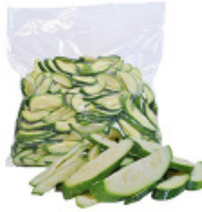
Squash Halfmoon Bias Cut