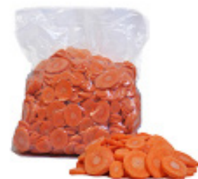
Carrot Coin 1/4" 2 - 5 lbs. # 136800 3/8" 2 - 5 lbs. # 136802