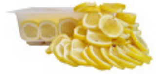
Lemon Sliced 1/4"