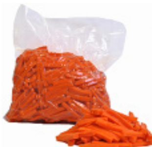
Carrot Baton Cut 3/8" x 3" 2 - 5 lbs. # 461453 10+