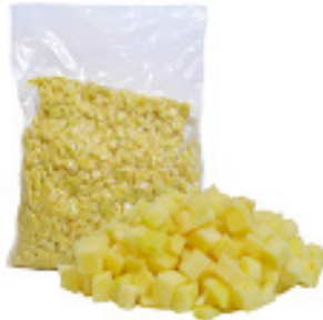
Squash Acorn Diced

2" 2 - 5 lbs. # 01-2488 10+ 3/4" 2 - 5 lbs. # 01-1700 10+ 3/8" 2 - 5 lbs. #654644313 10+