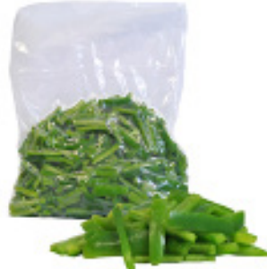
Peppers Green Sticks 1/2" x 3"

3/8" 2 - 5 lbs. #141100 1/4" 2 - 5 lbs. #141108 3/16" 2 - 5 lbs. #141609 10+