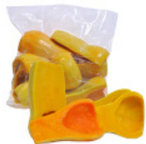
Squash Butternut Peeled

1" 2-5 lbs. #01-11909 3/4" 2-5 lbs. #15020 1/2" 2-5 lbs. #181060 1/4" 2-5 lbs. #180203 10+