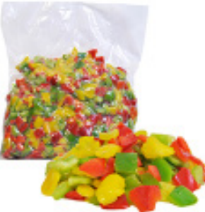
Pepper Diced Mixed

3/4" 2-5 lbs. #163901 10+ 1/4" 2-5 lbs. #175858 10+