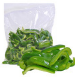
Pepper Green Wedge 1/2" x 3.5"