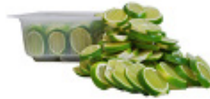
Lime Sliced 1/8"