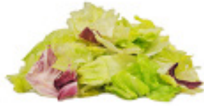
Lettuce Coach House Head Lettuce, Radhiccio