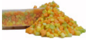
Fruit Mixed, Diced

Green & red grapes, melon cantaloupe chunks, melon honeydew chunks, pineapple chunks