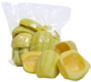
Squash Acorn Half Moon