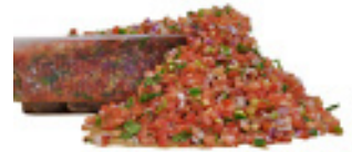
Pico De Gallo