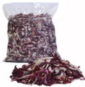
Lettuce Radicchio Julienne 1/8" 2 - 5 lbs. # 081481 10+