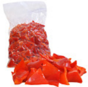
Pepper Red Bistro

Cut 2-5 lbs. #167503 Small 2-5 lbs. #167506 10+