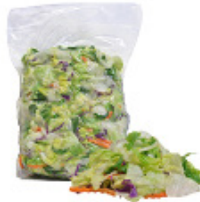
Lett. Romaine Blend 70/30 Carrots/Cabbage