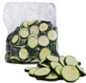
Squash Zucchini Coins

3/8" 2-5 lbs. # 142901 10+ 1/4" 2-5 lbs. # 142900