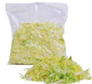
Cabbage Shred NO Color 1/8" 4 - 5 lbs. #136001