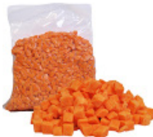
Potato Peeled Sweet Diced