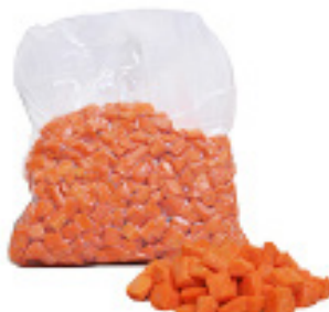
Carrot Diced 1" 2 - 5 lbs. # 01-1837 10+ 3/4" 2 - 5 lbs. # 137101 10+ 1/2" 2 - 5 lbs. # 136900 3/8" 2 - 5 lbs. # 137100 1/4" 2 - 5 lbs. # 137000