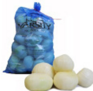
Onion Whole Peeled