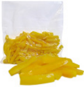
Peppers Sticks Yellow 1/2" x 3"