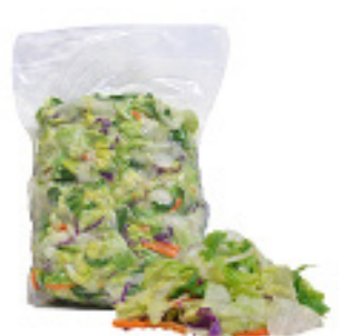
Lettuce 80/20 Wicked Lettuce / Carrots & Radhiccio 2 - 5 lbs. # 139005 10+