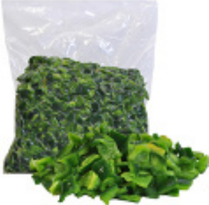
Pepper Poblano Diced 1/2"