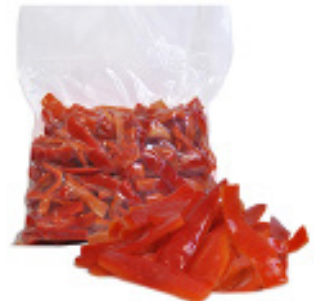
Peppers Red Sticks

3/8" 2 - 5 lbs. #141300 1/4" 2 - 5 lbs. #154402