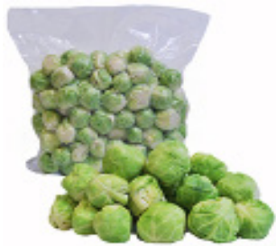
Brussel Sprouts Cleaned & Trimmed Whole 4 - 5 lbs. # EC-4168 Shredded 2 - 3 lbs. # MWF-1908