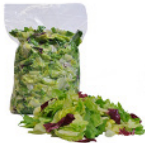
Lett. O'HARE Blend Romaine, Head Lettuce, Radhiccio