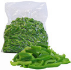
Pepper Green Julienne 1 - 5 lbs. #134700

3/8" 2 - 5 lbs. #141100 1/4" 2 - 5 lbs. #141108 3/16" 2 - 5 lbs. #141609 10+