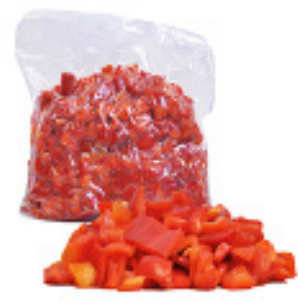
Pepper Red Diced

Cut 2-5 lbs. #167503 Small 2-5 lbs. #167506 10+