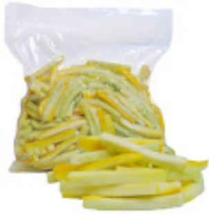
Squash Yellow Sticks