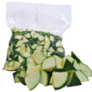
Squash Zucchini Bistro Cut