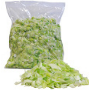
Leek Diced 1/2" 2 - 5 lbs. # 030508 10+