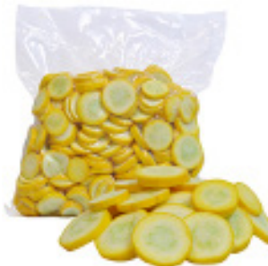
Squash Yellow Coins

1-5 lbs. # 196875 10+ 1/4" 2-5 lbs. # 142700 10+