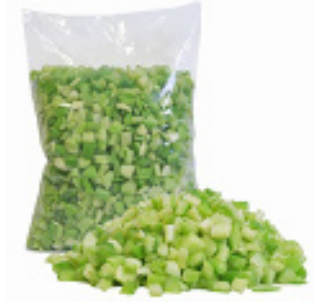
Celery Diced 1/2"