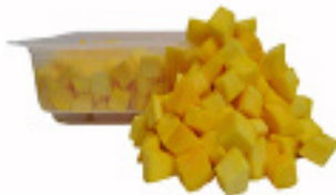
Mango Chunk 3/4"